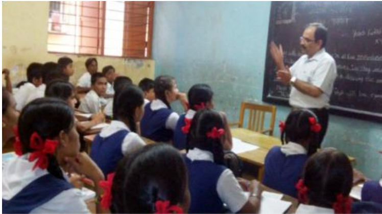
Training on 'English Speaking'