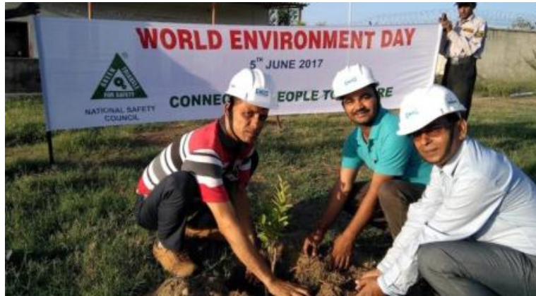
'Tree Plantation' on World Environment Day