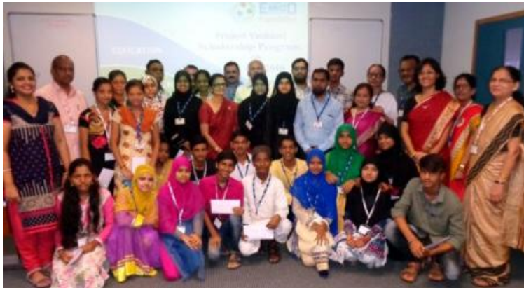
'Yashasvi' Scholarship Recipients