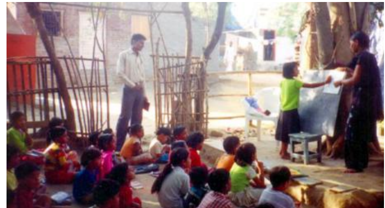
'Shiksha' Classes conducted in slums