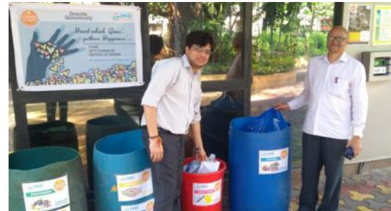
Joy of Giving - 'Daan Utsav'