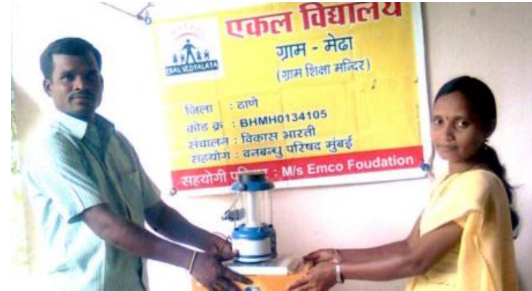
Solar Lantern Distribution