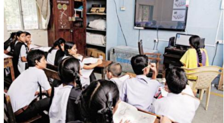
'E-Learning' is in-process